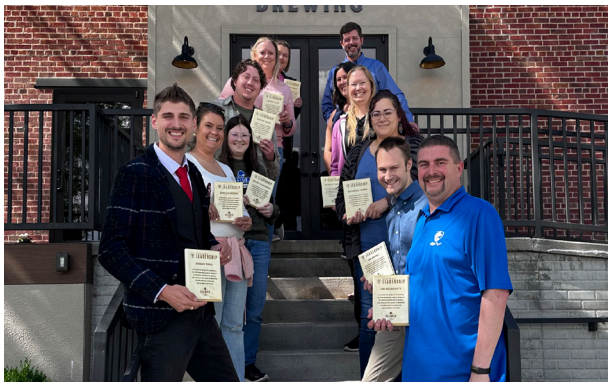
2026-2027 Leadership Graduates