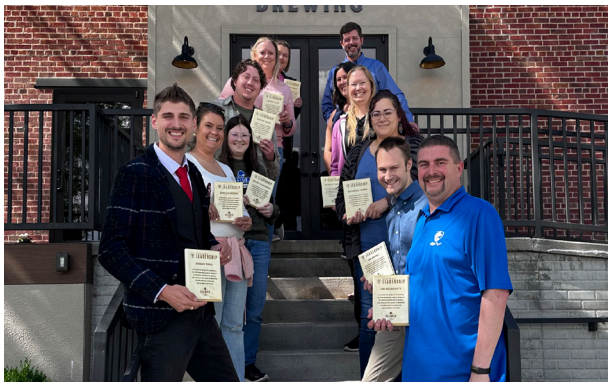
2024-2025 Leadership Graduates